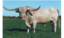
MK SALT SHAKER