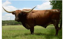
ROE'S DANDY 24/1