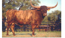
TAR BABY'S D LITE